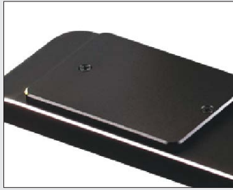
ALUMINUM BATTERY COVER UNIQUE CORNER CUTTING