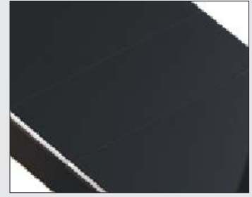
INVISIBLE CYLINDER STRUCTURE EASY TO TAKE WITH MAGNET