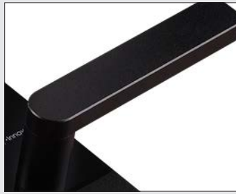
SOLID ALUMINUM HANDLE STRONG AND DURABLE EVEN UNDER HIGH HUMIDITY AREA