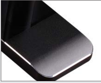
SOLID ALUMINUM MATERIAL BLACK OXIDATION TREATMENT