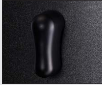
BLACK NICKEL PLATING THUMB KNOB