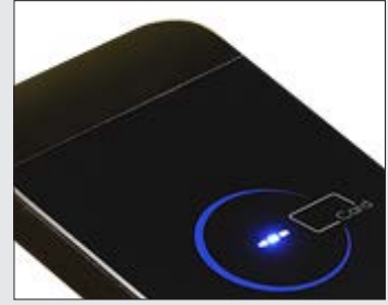
SPECIAL MOON SIGNAL LIGHT TIP ALARM IF DOOR IS NOT CLOSED WELL